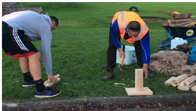
Preparing the pit...