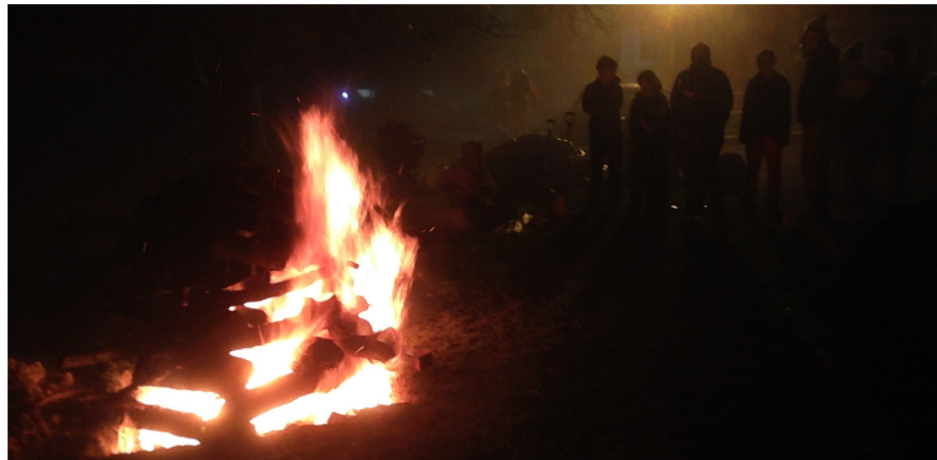
Putting in the food and covering the hāngi...