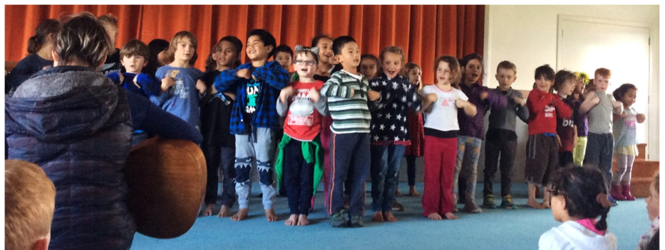
Thank you to everyone for making it such a great day!