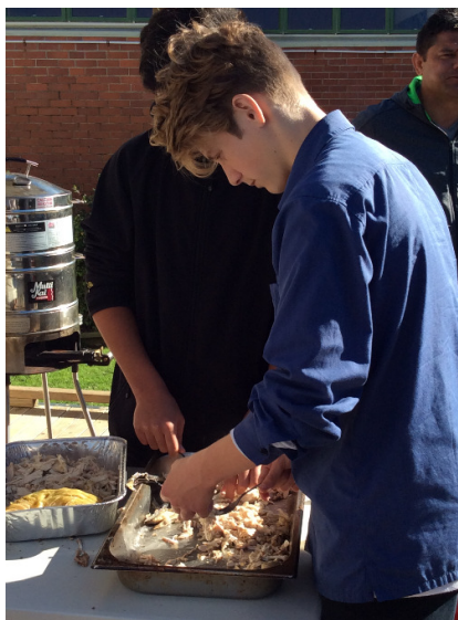
The hākari (feast) prepared by our hosts!