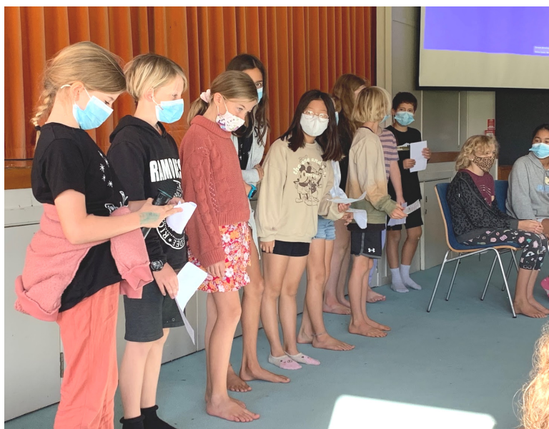
Whanau Kokoru shared some stories and poems, and then a slideshow of photos from camp MERC.