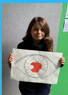
"...the apple of my eye"