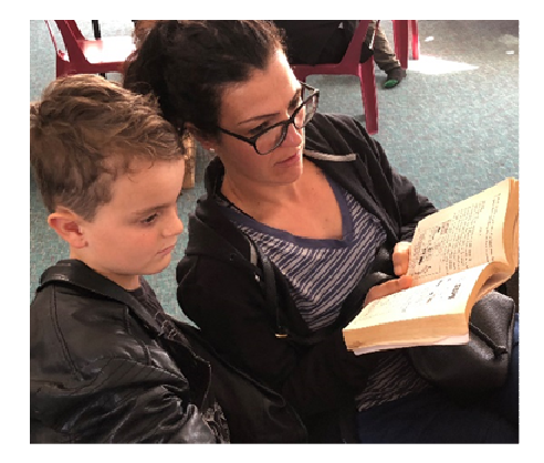
Book Week Breakfast