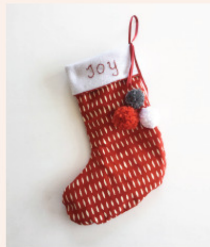
Learn to Sew a Christmas Stocking - 21st December

January Workshops Include Sewing: Panda Cushions, Pajama making, Room decor, Summer Tops, Future Fashion Designers