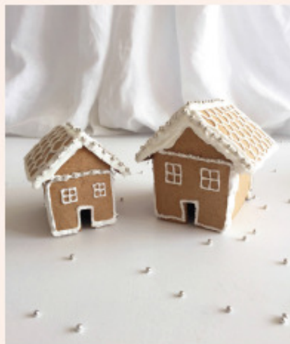
Sewing & Gingerbread Houses - 20th December