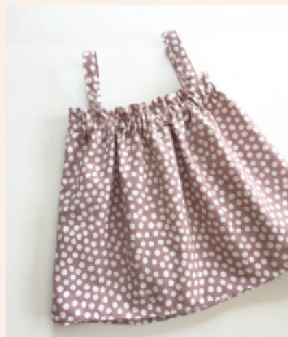
Learn to Sew a Summer Top - 19th December