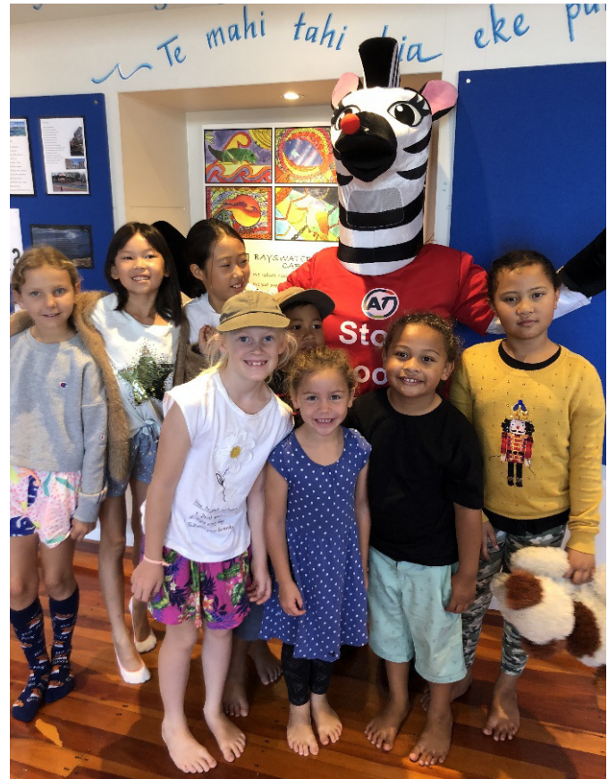
The children enjoyed walking to school with Zara the Zebra!