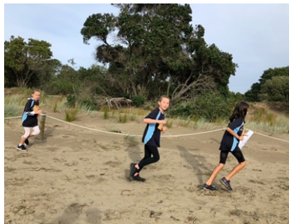
Eager to get to the next checkpoint