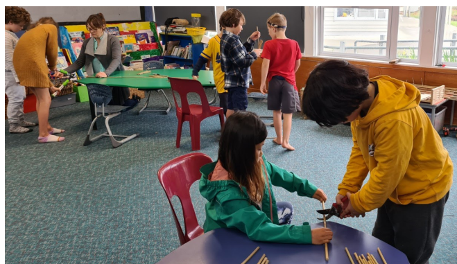
Collaboration in action