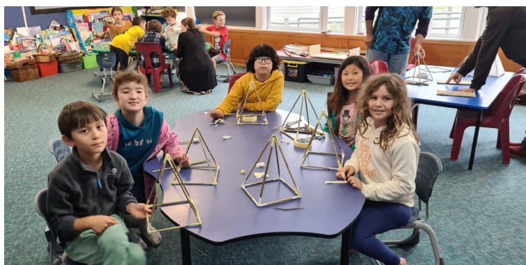
Come along to Matariki Festival on Saturday 3rd July to see the finished product.

The Matariki Festival is only three weeks away.