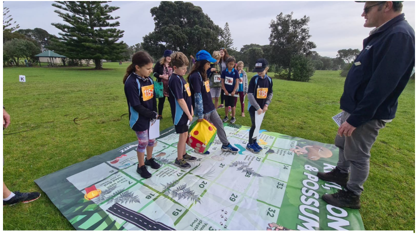
Survive and thrive in our awesome NZ Ngahere