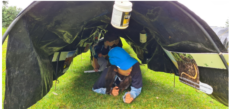
Imagine being a worm wriggling through soil, spotting things that contain carbon and contribute to healthy soil.