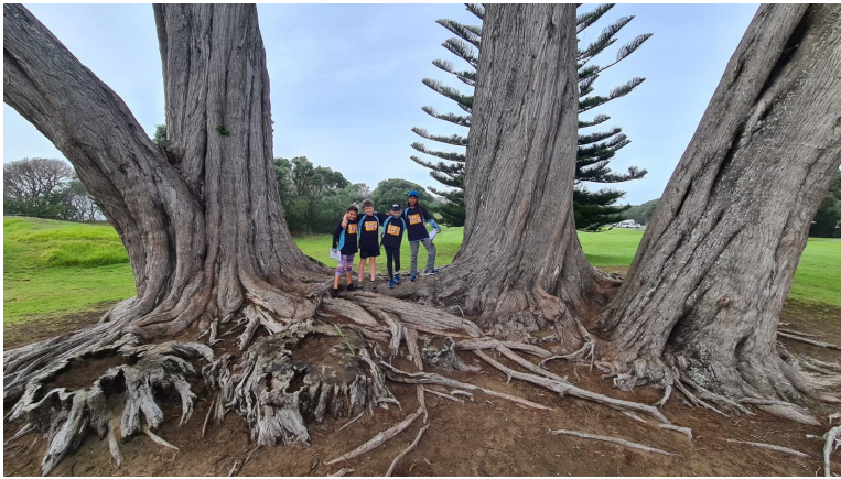
Creative team photo