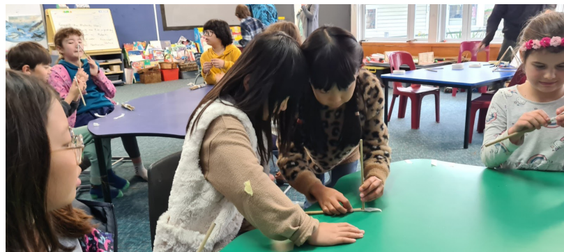
Offering support when needed