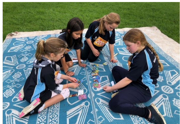
Spot the native birds and place them in order