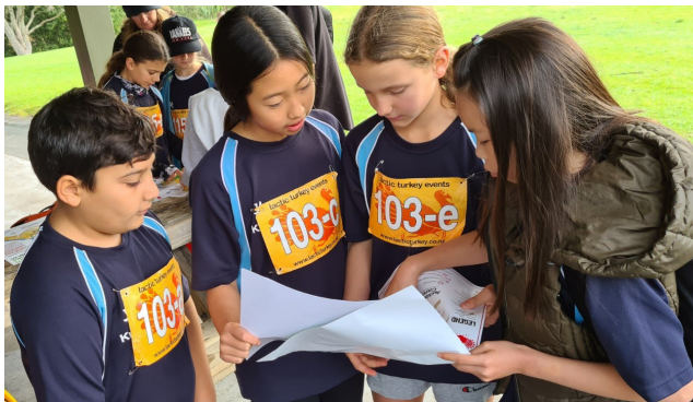
Planning, map reading and strategizing