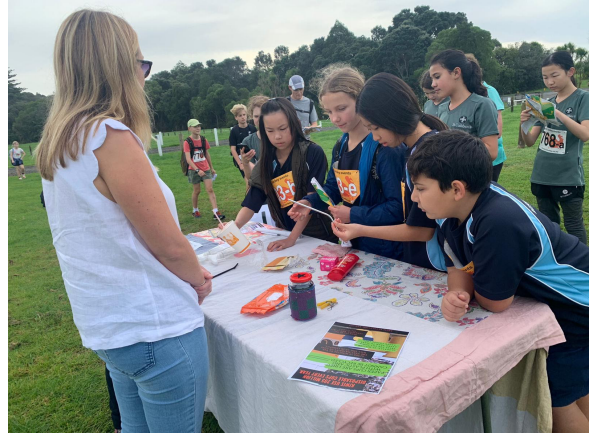
Swap the unsustainable items