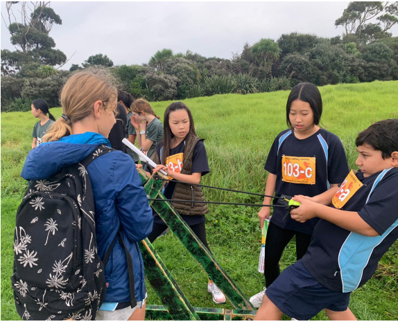
Hit the marine pest