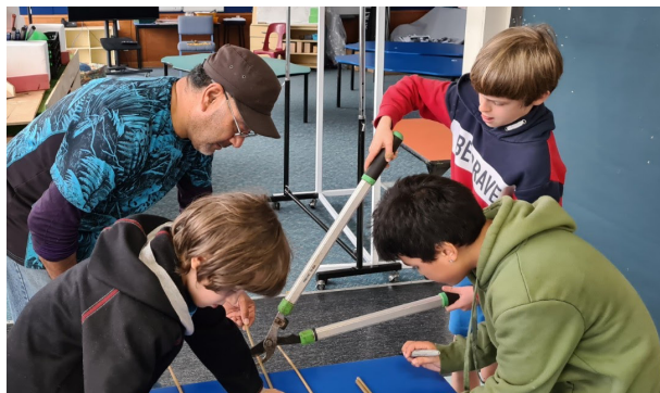
Cutting the bamboo using garden tools

This was a great STEAM (Science, Technology, Engineering, Art and Maths) opportunity as the children measured, cut and assembled bamboo sticks to create the pyramid shaped lanterns. The same group of children will be visiting the Devonport ArtSpace to create Matariki korero art related to the nine stars of Matariki.